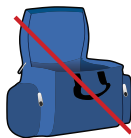
* Camera Bag